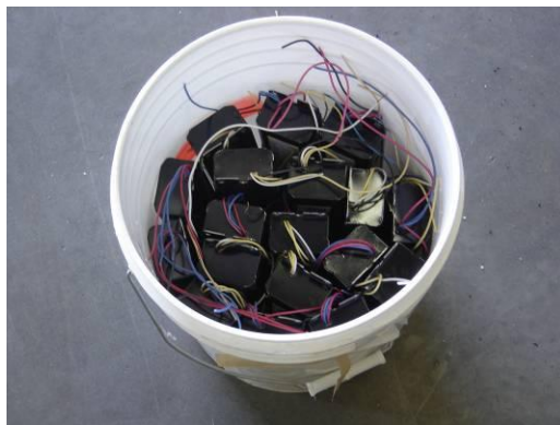
Vertical layer of ballasts

3) Five-gallon buckets work well to ship non-PCB ballasts. When stacked properly, 20-24 ballasts should fit into each 5-gallon bucket (60-70 pounds). Begin by stacking the ballasts vertically in the buckets as a first layer. Finish filling the bucket by stacking ballasts horizontally.