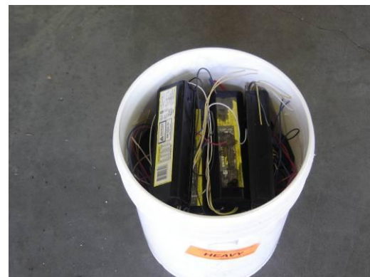
Horizontal layer of ballasts

4) Seal a lid tightly onto the bucket. Contact your shipper concerning proper labeling. The picture below displays how Alaska Building Science Network labels the lids of their ballast buckets.