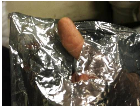
If your thumb can't stretch the film or quickly breaks through, then the film is not recyclable in Anchorage.