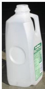
This milk jug is recyclable