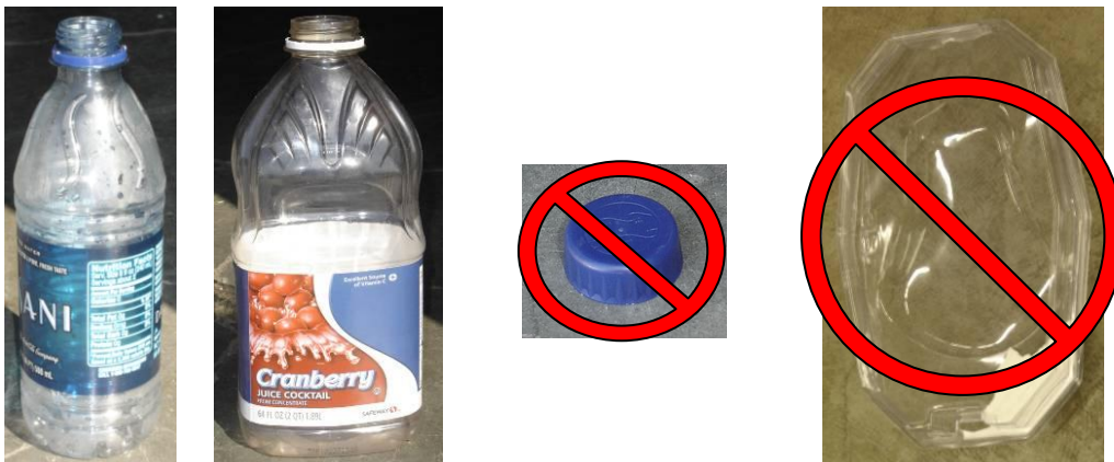
Examples of #1 bottles. Caps cannot be recycled with the bottles. Plastics #1 containers are also not recyclable in Anchorage.