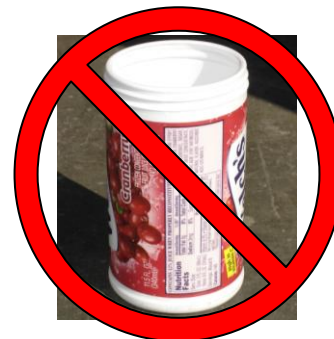
This juice container is not recyclable