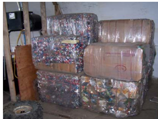
Cans and plastics baled in Akiachak