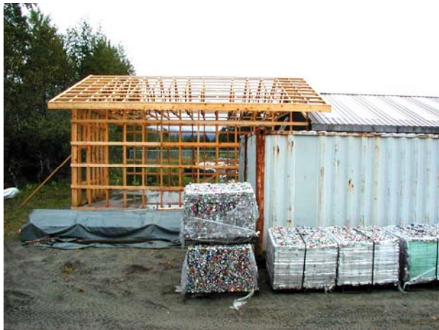
Bales of Aluminum cans next to Gustavus's new Landfill building.